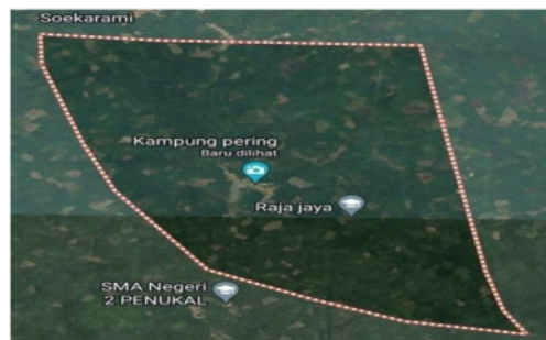
Image of Microhydro Power Plant Research Location Map

In writing this thesis, the author conducted research at the Raja Jaya Village Dam, Penukal District, PenukalAbab Regency Lematang Ilir, South Sumatra