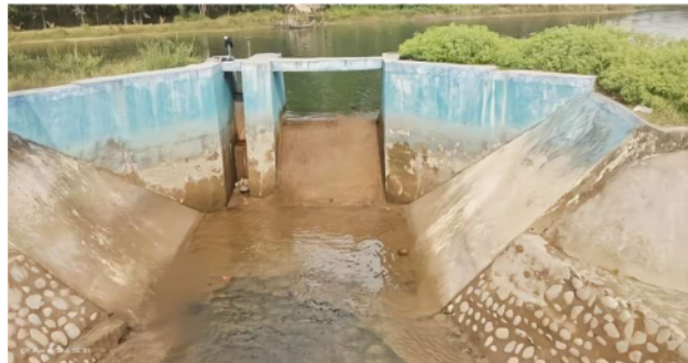
Image of the Raja Jaya Village Dam Channel